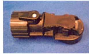
DH-5 28 MM