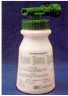
ORG – 2 “The Organizer” Clog Free Lawn and Garden Feeder