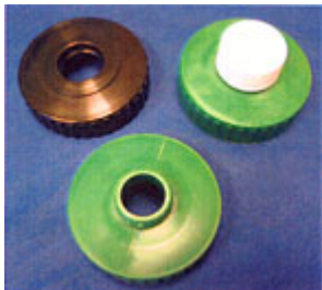
ADPT-1 70 mm Adapter Caps